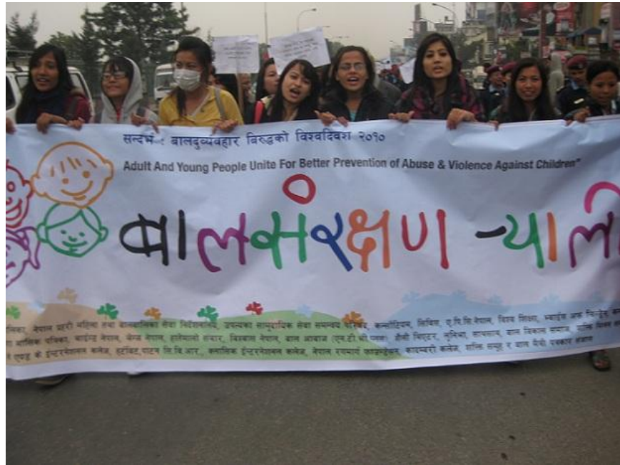
Activists carrying a banner in the rally organized on the World Day for Prevention of Child Abuse, 19 th of November.