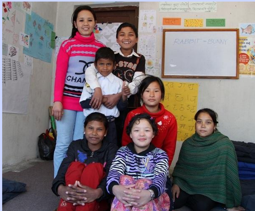
The education based Outreach Centers are important places: Basundhara ORC's pupils with their teacher.